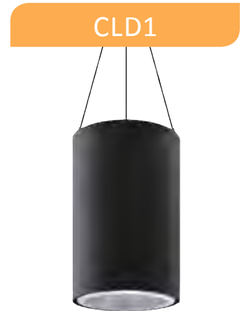
Cylinders Double Light Suspended Tri-Cable