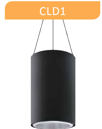
Cylinders Double Light Suspended Tri-Cable