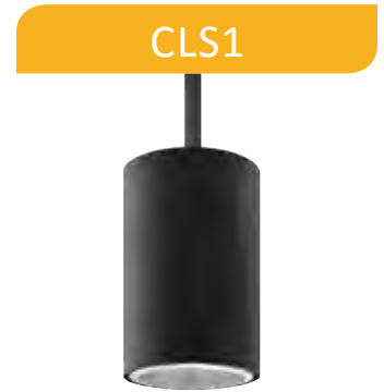
Cylinders Single Light Pendant