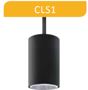
Cylinders Single Light Pendant