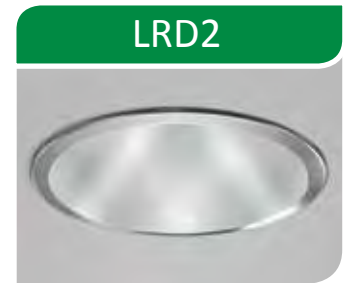
Downlights LED Retrofit Downlights GE Module